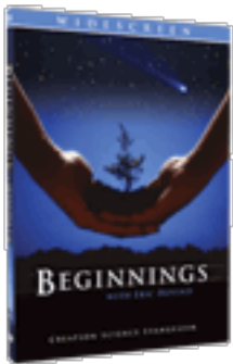
Beginnings Series #109DVD