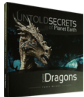
Untold Secrets of Planet Earth: Dire Dragons #4222

To order, visit www.creationstore.org or call 1-850-479-3466.