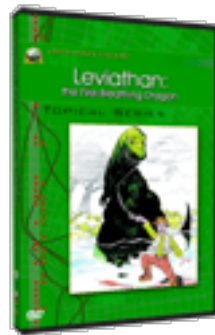
Leviathan DVD #311DVD